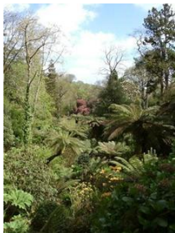
One of the most popular botanical gardens in the UK