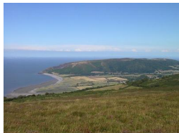
Beautiful national park spanning Somerset and Devon

Parks Gardens and Woodlands, Horse Riding and Pony Trekking, Shooting and Fishing, Walking and Climbing