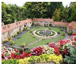
Thousands of miniature buildings, people and vehicles capture the essence of England's past, present and future