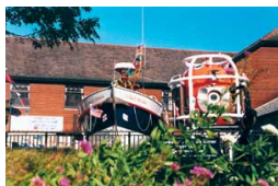
Varying exhibitions displaying artifacts from shipwrecks, local village life and the clay industry