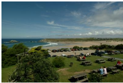
Freehouse Restaurant with stunning views on West Pentir Headland overlooking Crantock Beach, between Newquay and Perranporth