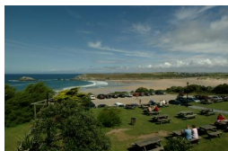
Freehouse Restaurant with stunning views on West Pentir Headland overlooking Crantock Beach, between Newquay and Perranporth