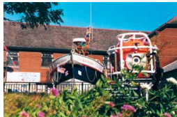
Varying exhibitions displaying artifacts from shipwrecks, local village life and the clay industry