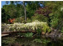
Park and Gardens in Cornwall