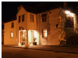
Fine destination pub/restuarant