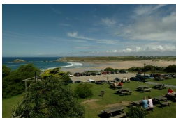
Freehouse Restaurant with stunning views on West Pentir Headland overlooking Crantock Beach, between Newquay and Perranporth