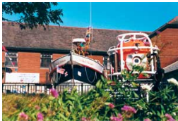
Varying exhibitions displaying artifacts from shipwrecks, local village life and the clay industry