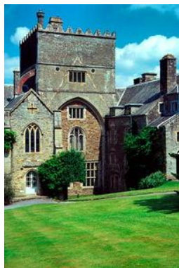
700 year-old home of Sir Francis Drake run by the National Trust

Historic Buildings and Monuments, Visitor Centres and Museums, Childrens Attractions, Cafes Coffee Shops and Tearooms