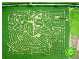
Situated on a working farm with a range of activities