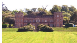
Red Stone Tudor Mansion

Historic Buildings and Monuments, Parks Gardens and Woodlands