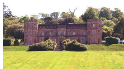
Red Stone Tudor Mansion