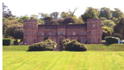
Red Stone Tudor Mansion