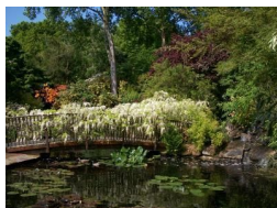
Park and Gardens in Cornwall