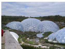
World Famous visitor attraction in Cornwall - the living theatre of plants and people. Located near St Austell in Cornwall

Lochs Lakes and Waterfalls, Parks Gardens and Woodlands, Tours and Trips, Visitor Centres and Museums, Childrens Attractions, Zoos Farms and Wildlife Parks, Cafes Coffee Shops and Tearooms