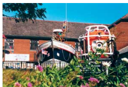
Varying exhibitions displaying artifacts from shipwrecks, local village life and the clay industry