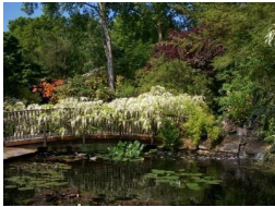
Park and Gardens in Cornwall