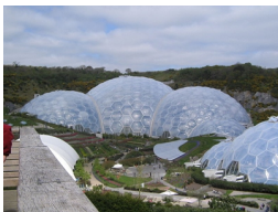
World Famous visitor attraction in Cornwall - the living theatre of plants and people. Located near St Austell in Cornwall

Lochs Lakes and Waterfalls, Parks Gardens and Woodlands, Tours and Trips, Visitor Centres and Museums, Childrens Attractions, Zoos Farms and Wildlife Parks, Cafes Coffee Shops and Tearooms