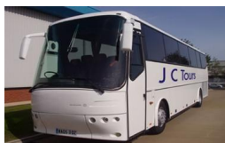
JC Tours is a leading coach and minibus company based in Mid-Cornwall specialising in all types of group travel.

Tours and Trips, Guided Tours and Day Trips