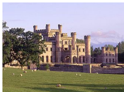
Magnificent ruined castle in the grounds of the Lowther Estate

Historic Buildings and Monuments, Parks Gardens and Woodlands