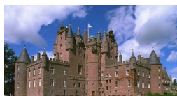
Childhood home of Her Majesty Queen Elisabeth The Queen Mother

Glamis, DD8 1RJ, Angus and Dundee, Scotland