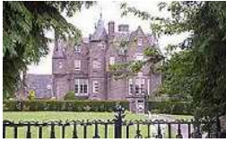
Regimental Museum of the Proud and Illustrious Black Watch Regiment in Perth Scotland

Perth, PH1 5HR, Perth and Kinross, Scotland