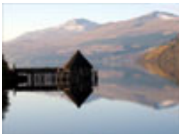
Archaeological Open-Air Museum

Historic Buildings and Monuments, Visitor Centres and Museums