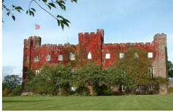
Scone Palace occupies a unique position in Scottish History

Historic Buildings and Monuments, Parks Gardens and Woodlands