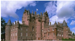
Childhood home of Her Majesty Queen Elisabeth The Queen Mother

Glamis, DD8 1RJ, Angus and Dundee, Scotland