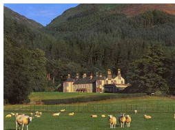
Family home with close links to Tennyson