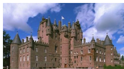
Childhood home of Her Majesty Queen Elisabeth The Queen Mother

Glamis, DD8 1RJ, Angus and Dundee, Scotland