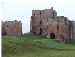
13th Century Fortress ruins