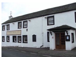
Fantastic Pub and Restaurant and home to the Tirril Brewery