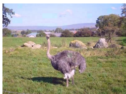
Working farm with rare breeds and fantastic childrens play areas

Indoor and Outdoor Play Areas, Zoos Farms and Wildlife Parks, Cafes Coffee Shops and Tearooms