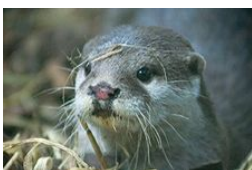
A unique freshwater aquarium situated on the southern shore of Lake Windermere in Cumbria, the Lake District.

Visitor Centres and Museums, Aquariums, Childrens Attractions, Cafes Coffee Shops and Tearooms