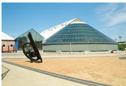
Home to a wealth of objects and information on the social and industrial history of the Furness area

Historic Buildings and Monuments, Visitor Centres and Museums, Childrens Attractions, Indoor and Outdoor Play Areas, Cafes Coffee Shops and Tearooms