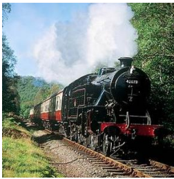
Travel through time in the lake district

Tours and Trips, Childrens Attractions, Cafes Coffee Shops and Tearooms, Railways