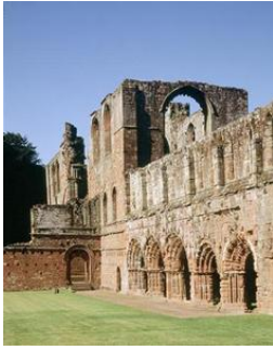
English Hertiage run remains of an 12th century abbey

Barrow-in-Furness, LA13 0PJ, Cumbria, England