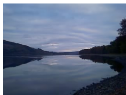
Loch Venachar, The Trossachs

Callander, FK8 3EN, Stirlingshire, Scotland