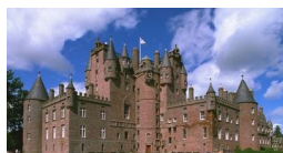
Childhood home of Her Majesty Queen Elisabeth The Queen Mother

Glamis, DD8 1RJ, Angus and Dundee, Scotland