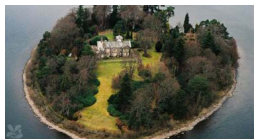
18th-century house on an idyllic island