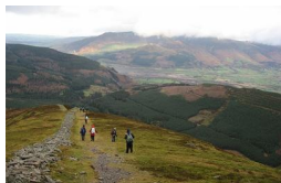
Gentle Ascent to some of the most stunning views in the lakes