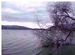
Popular and picturesque lake in the English Lake District

Lochs Lakes and Waterfalls, Sailing and Watersports, Walking and Climbing, Boat Trips