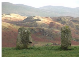
Ancient stone circle in beautiful surroundings in the Lake District