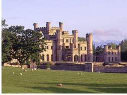
Magnificent ruined castle in the grounds of the Lowther Estate

Historic Buildings and Monuments, Parks Gardens and Woodlands