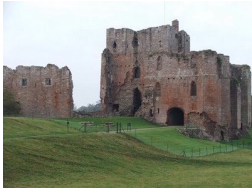
13th Century Fortress ruins