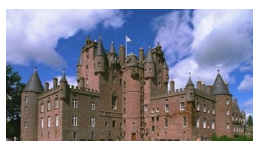
Childhood home of Her Majesty Queen Elisabeth The Queen Mother

Glamis, DD8 1RJ, Angus and Dundee, Scotland