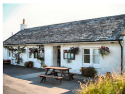
Breathtaking Scenery and Wildlife at the Mersehead Nature Reserve - Managed by the RSPB

Parks Gardens and Woodlands, Tours and Trips, Visitor Centres and Museums