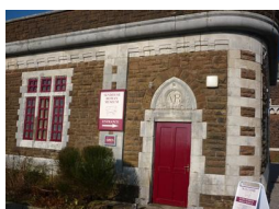
Award winning Museum is next to a Roman fort built on the orders of the emperor Hadrian nearly two thousand years ago

Visitor Centres and Museums, Childrens Attractions