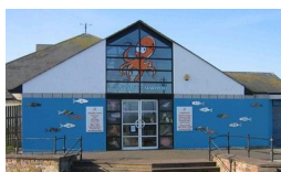
Great aquarium - fun for all the family

Visitor Centres and Museums, Aquariums, Childrens Attractions, Zoos Farms and Wildlife Parks, Cafes Coffee Shops and Tearooms, Shops