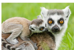
Over 100 species from rare breed domestic animals like pigs and goats, to endangered wildlife like Lemurs and Gibbons. Spot zebra at the top of the park, cosy up to reptiles in the encounter room, watch the Bird of Prey flying displays. Indoor play.

Childrens Attractions, Zoos Farms and Wildlife Parks, Cafes Coffee Shops and Tearooms