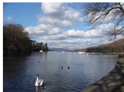
Country park beside Lake Windermere

Newby Bridge, LA12 8NN, Cumbria, England