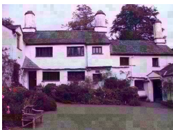
Fine example of Lake District vernacular architecture