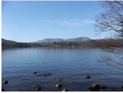
The longest natural lake in England