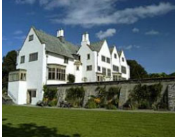
The Arts & Craft House

Historic Buildings and Monuments, Parks Gardens and Woodlands, Visitor Centres and Museums, Childrens Attractions, Cafes Coffee Shops and Tearooms