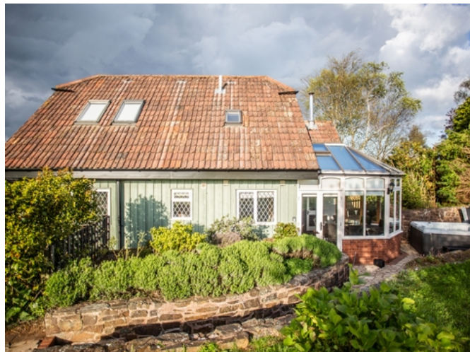
Fig Tree Cottage