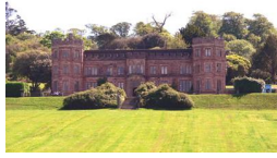
Red Stone Tudor Mansion