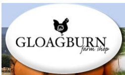
The Gloagburn Farm Shop and Café are a local business of high quality offering local produce as well as a café.

Tibbermore, PH1 1QL, Perth and Kinross, Scotland