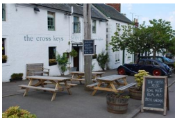
Traditional and comfortable inn situated in the village of Kippen, Stirlingshire. We serve food all day from soups to sirloins, with home made pies and puddings to finish. Every Sunday is roast day featuring two types of roast. Children Welcome.

Kippen, FK8 3DN, Stirlingshire, Scotland