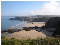
World Famous surfing Beach in Newquay, Cornwall