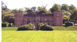
Red Stone Tudor Mansion