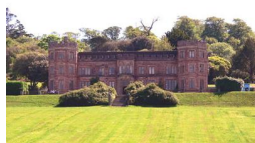
Red Stone Tudor Mansion