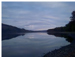
Loch Venachar, The Trossachs

Callander, FK8 3EN, Stirlingshire, Scotland