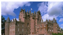
Childhood home of Her Majesty Queen Elisabeth The Queen Mother

Glamis, DD8 1RJ, Angus and Dundee, Scotland