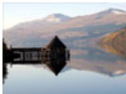
Archaeological Open-Air Museum

Kenmore Aberfeldy, PH15 2HY, Perth and Kinross, Scotland