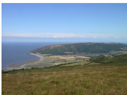
Beautiful national park spanning Somerset and Devon

Parks Gardens and Woodlands, Horse Riding and Pony Trekking, Shooting and Fishing, Walking and Climbing