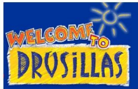
A collection of small and medium sized exotic animals Voted the number one attraction in Sussex for days out with the kids

Alfriston, BN26 5QS, East Sussex, England