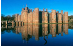
Magnificent moated castle in East Sussex

Historic Buildings and Monuments, Parks Gardens and Woodlands