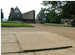
Battle Abbey and the famous battlefield in East Sussex

Historic Buildings and Monuments, Visitor Centres and Museums, Childrens Attractions