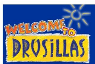
A collection of small and medium sized exotic animals Voted the number one attraction in Sussex for days out with the kids

Alfriston, BN26 5QS, East Sussex, England