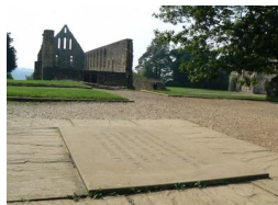
Battle Abbey and the famous battlefield in East Sussex

Historic Buildings and Monuments, Visitor Centres and Museums, Childrens Attractions