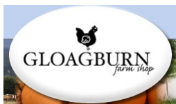
The Gloagburn Farm Shop and Café are a local business of high quality offering local produce as well as a café.

Tibbermore, PH1 1QL, Perth and Kinross, Scotland