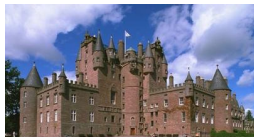
Childhood home of Her Majesty Queen Elisabeth The Queen Mother

Glamis, DD8 1RJ, Angus and Dundee, Scotland