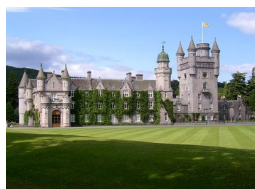
5 Star visitor attraction set amongst the magnificent scenery of Royal Deeside

Historic Buildings and Monuments, Parks Gardens and Woodlands, Visitor Centres and Museums