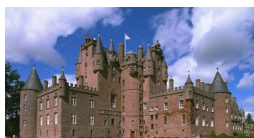
Childhood home of Her Majesty Queen Elisabeth The Queen Mother

Glamis, DD8 1RJ, Angus and Dundee, Scotland