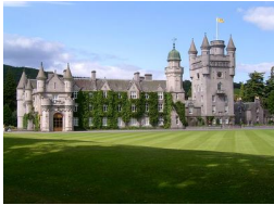
5 Star visitor attraction set amongst the magnificent scenery of Royal Deeside

Historic Buildings and Monuments, Parks Gardens and Woodlands, Visitor Centres and Museums