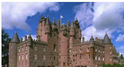
Childhood home of Her Majesty Queen Elisabeth The Queen Mother

Glamis, DD8 1RJ, Angus and Dundee, Scotland