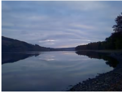
Loch Venachar, The Trossachs

Callander, FK8 3EN, Stirlingshire, Scotland