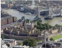
Famous landmark one of the Historic Royal Palaces

Historic Buildings and Monuments, Visitor Centres and Museums, Childrens Attractions