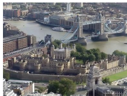
Famous landmark one of the Historic Royal Palaces

Historic Buildings and Monuments, Visitor Centres and Museums, Childrens Attractions