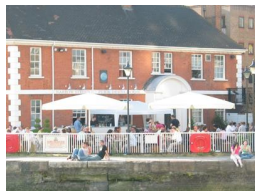
Chef Gordon Ramsay's newest Gastro Pub

London, E14 8DW, Greater London, England