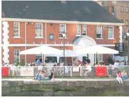
Chef Gordon Ramsays newest Gastro Pub

London, E14 8DW, Greater London, England