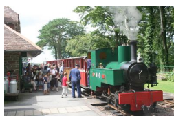
A restored narrow gauge steam railway in the Exmoor National Park area of North Devon. One mile of the original 19 miles has so far been re-opened.

Tours and Trips, Cafes Coffee Shops and Tearooms, Railways