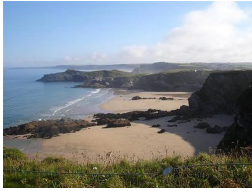
World Famous surfing Beach in Newquay, Cornwall