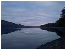
Loch Venachar, The Trossachs

Callander, FK8 3EN, Stirlingshire, Scotland