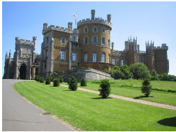
Home of Duke and Duchess of Rutland

Festivals and Events, Historic Buildings and Monuments, Parks Gardens and Woodlands