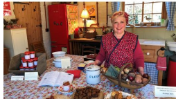
Traditional Craft & Cookery Courses and Exhibition of Memorabilia including WW2 Women's Land Army