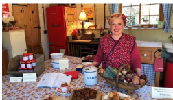
Traditional Craft & Cookery Courses and Exhibition of Memorabilia including WW2 Women's Land Army