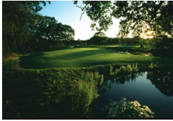
The Home of English Golf

Woodhall Spa, LN10 6PU, Lincolnshire, England