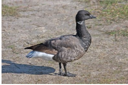
RSPB Nature Reserve and Visitor Centre. A major new extension to this coastal wetland reserve

Nature Reserve, Visitor Centres and Museums, Childrens Attractions, Zoos Farms and Wildlife Parks