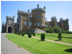
Home of Duke and Duchess of Rutland

Festivals and Events, Historic Buildings and Monuments, Parks Gardens and Woodlands