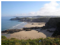
World Famous surfing Beach in Newquay, Cornwall