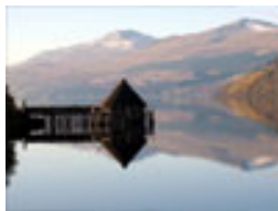
Archaeological Open-Air Museum

Kenmore Aberfeldy, PH15 2HY, Perth and Kinross, Scotland