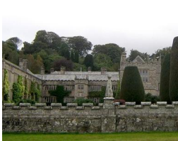
Magnificent late Victorian country house with extensive servants' quarters, gardens and wooded estate

Historic Buildings and Monuments, Parks Gardens and Woodlands, Visitor Centres and Museums, Childrens Attractions, Indoor and Outdoor Play Areas, Cafes Coffee Shops and Tearooms, Restaurants