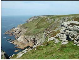
Lundy Island and Nature Reserve

Beaches, Tours and Trips, Childrens Attractions, Pubs and Bars, Walking and Climbing