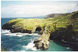
Breathtaking ruined castle on the Cornish Coast - mythical home of King Arthur

Beaches, Historic Buildings and Monuments, Lochs Lakes and Waterfalls, Parks Gardens and Woodlands, Visitor Centres and Museums, Childrens Attractions, Cafes Coffee Shops and Tearooms, Pubs and Bars, Shops